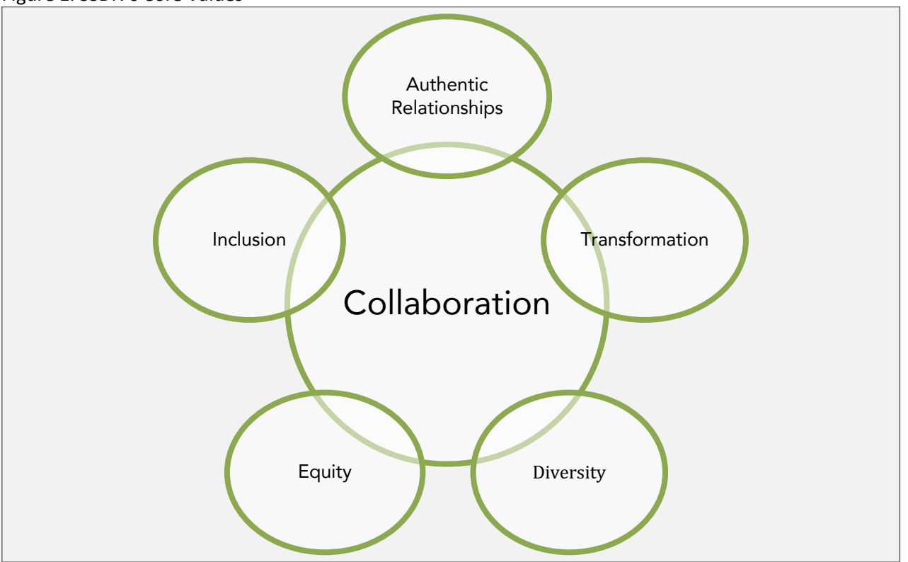
Figure 1. SSDN's Core Values

Inclusion : We create an environment in which everyone feels valued and respected and is invited to participate.